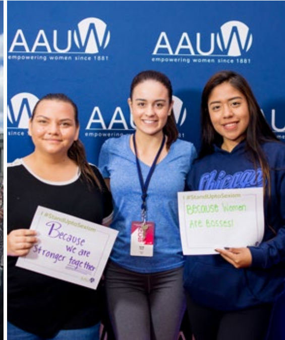
AAUW student leadership conference attendees