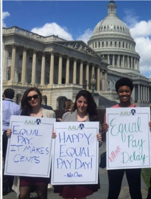
AAUW equal pay advocates on Capitol Hill