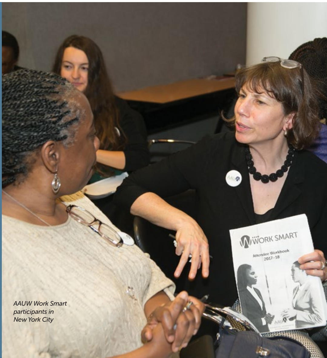
AAUW Work Smart participants in New York City